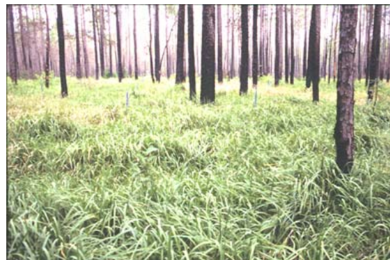
Charles T. Bryson, USDA ARS

Damaged forests are highly susceptible to invasive species, including Cogongrass (shown at left in a pine plantation), that can create extremely hazardous wildfire conditions. Also, invasive plant species whose seeds may be spread by wind, such Chinese tallow and Japanese climbing fern, often rapidly colonize disturbed forest sites.